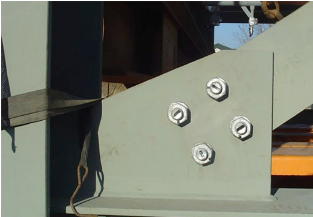
Figure 3: These four nuts appear to have been turned although the exact angle is not obvious since the lines extend completely through the bolts' diameters. Nevertheless, without inspection of their initial position, turn or whether the joint was properly snug-tightened, induced pretension cannot be verified.

While the CISC does not specifically require Pre-installation Verification testing of all fasteners when using Turn-of-Nut per se, testing is recommended to assure hardware compliance with the appropriate ASTM Specification. Thread failure (stripping) will not be discernible otherwise.