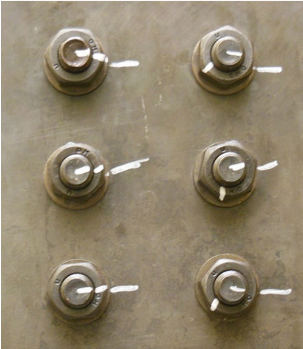
Figure 1: Ideal marking technique clearly indicating 1/3rd turn, However, the three bolts on the left are ready for initial inspection; the three on the right appear turned but it is impossible to know if they were turned or marked to appear turned.

does not relieve an inspector's responsibility to inspect the connection twice, before and after the turn.