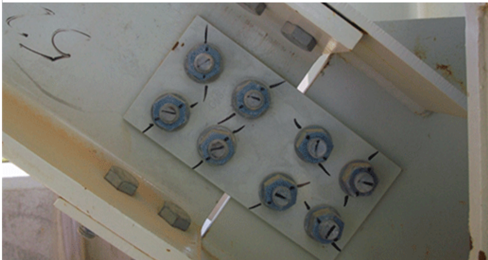
Figure 2: Obvious deception attempt. While markings suggest each nut or bolt has been rotated, the nut appears to be in its initial position suggesting bolt rotation. It is unlikely the bolts were rotated relative to the nuts since the washers are under the nuts, meaning the hex heads of the bolts would need to be rotated directly against the painted steel surface. A difficult endeavor, that would be exaggerated by the additional effort required to perform proper Turn-of-Nut in the first place. The gap along the upper flange also implies